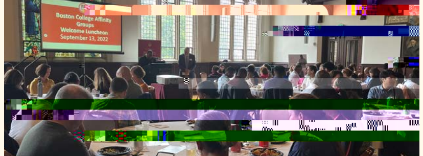
The 2022 Affinity Groups Welcome Luncheon